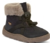
DARK BLUE G3110258-1