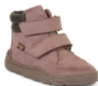
DARK PINK G2110150-5