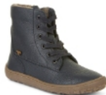
DARK BLUE G3160236-3