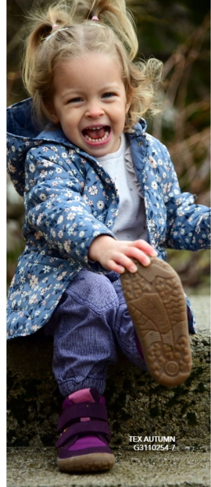
TEX AUTUMN G3110254-7