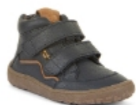
DARK BLUE G3110255