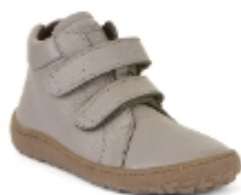
LIGHT GREY G3110252-5