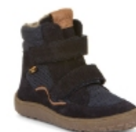
DARK BLUE G3160233