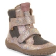
PINK SHINE G3160233-8