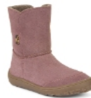
DARK PINK G3160238