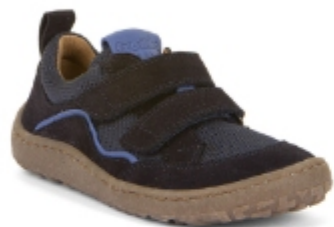
DARK BLUE G3130259