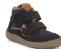
DARK BLUE G3110254-W