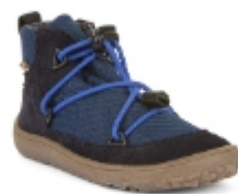
DARK BLUE G3110257