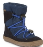
DARK BLUE G3160239-1

Natural wool and sheepskin fur serve as natural heat regulators.