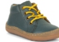
DARK GREEN G2130325-3