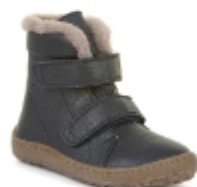
DARK BLUE G3160235-1