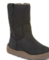
DARK BLUE G3160242-2