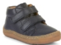
DARK BLUE G2130342-9