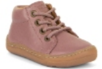
DARK PINK G2130325-5