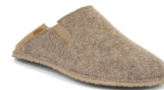
VERSATILE SLIPPERS Ensure comfort and practicality.