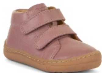
DARK PINK G2130342-13