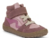
DARK PINK G3110256-7