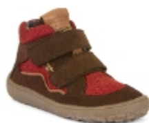
DARK BROWN G3110254-5