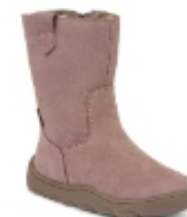
DARK PINK G3160242-3