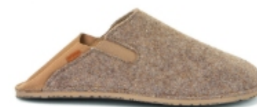
2-IN-1 DESIGN Classic slippers or casual slides.