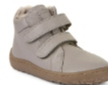
LIGHT GREY G3110252-5K