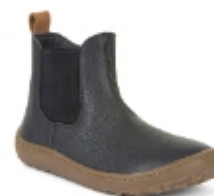
DARK BLUE G3160237