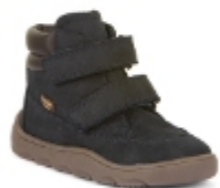
DARK BLUE G2110150