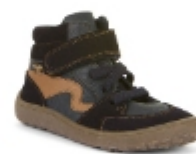
DARK BLUE G3110256-3