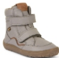
LIGHT GREY G3160232-4