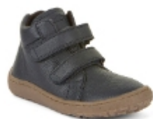
DARK BLUE G3110252