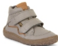
LIGHT GREY G3110255-4