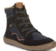
DARK BLUE G3160234-1