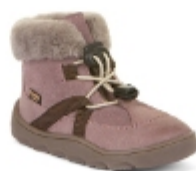
DARK PINK G3110258-4