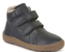
DARK BLUE G3110252-K