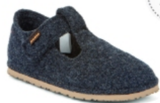
DARK BLUE G1700378