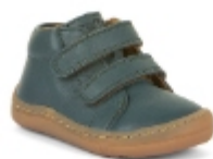
DARK GREEN G2130342-11