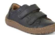
DARK BLUE G3130256