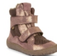
PINK GOLD G3160233-9