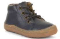
DARK BLUE G2130325