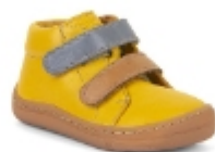
DARK YELLOW G2130342-1