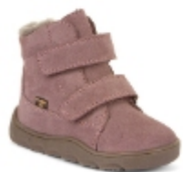
DARK PINK G2110149-6