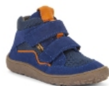
BLUE ELECTRIC G3110254-1