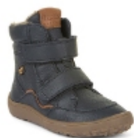
DARK BLUE G3160232