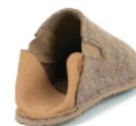
MICROFIBER HEEL PART Durable and comfortable.